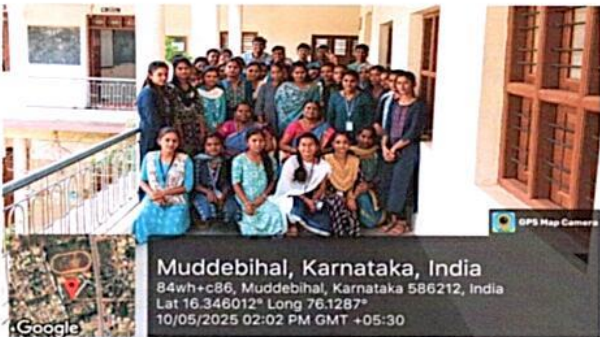
Staff and Students