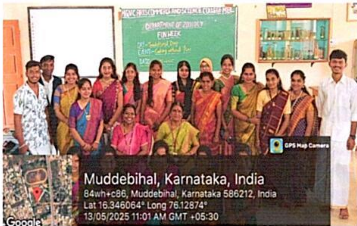
Staff and Students