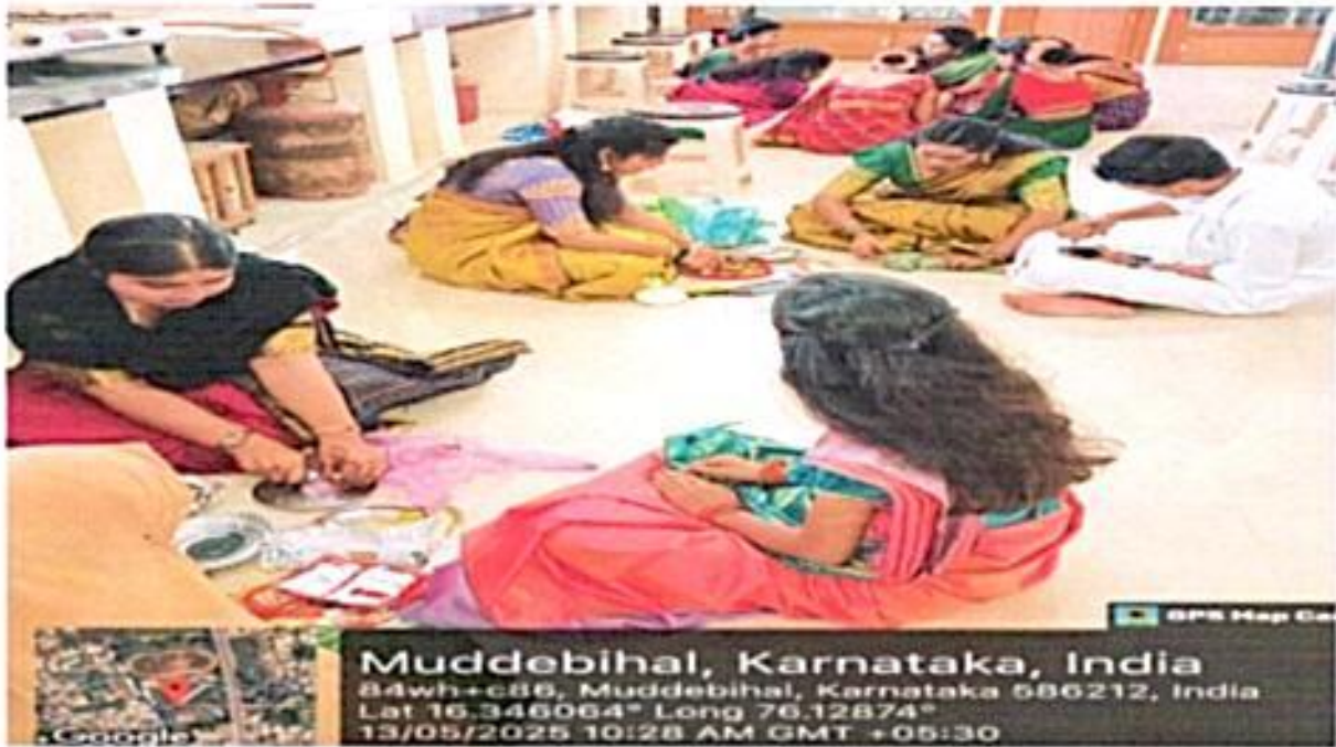
Students involved in the preparation of dishes