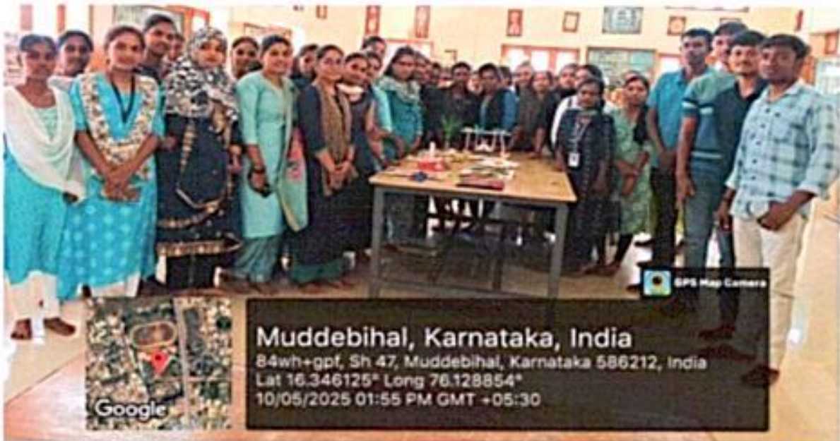
Students with their products of Best out of Waste