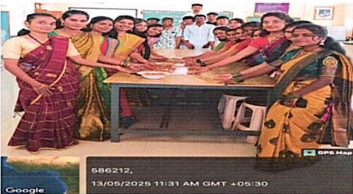
Students with their verity of dishes

Head of Cell M.G.V.C. Arts, Commerce & Science College MUDDEBIHAL-586212, Dist: Vijayapur.