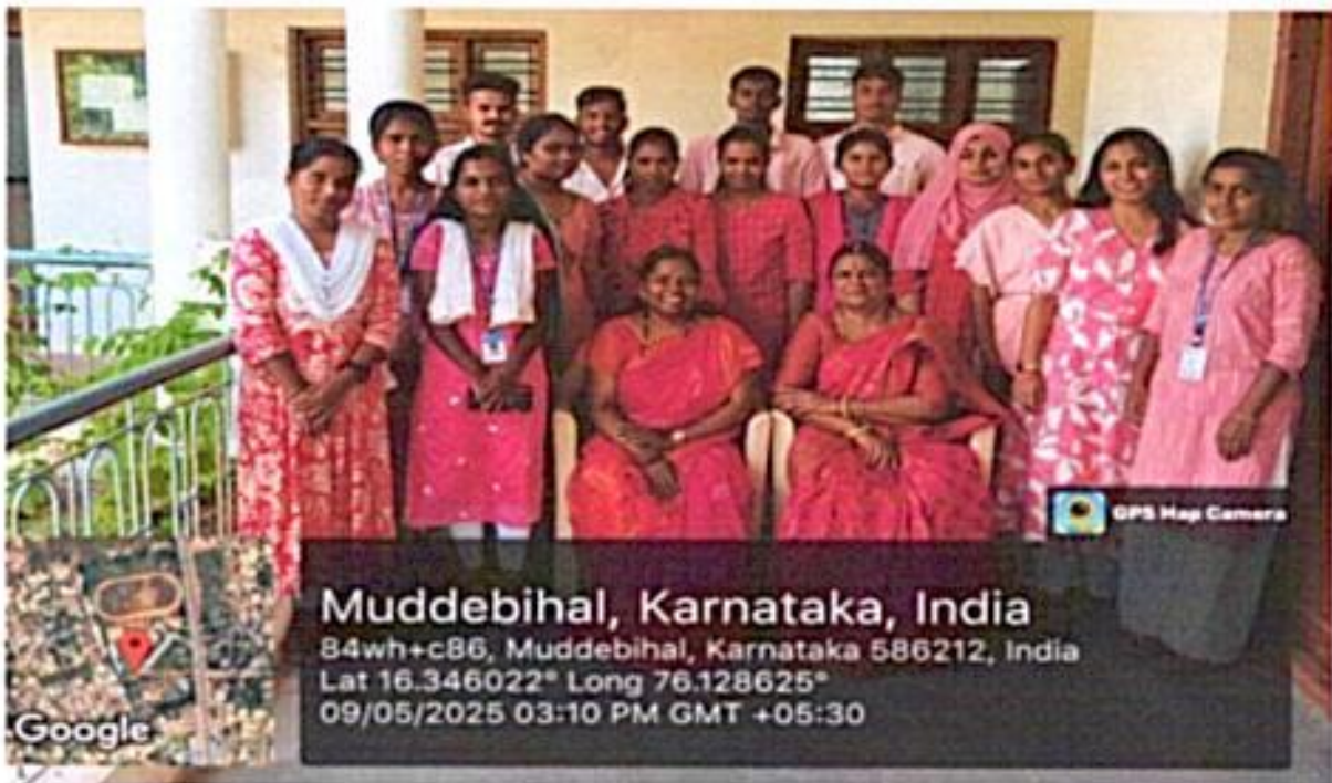
Staff and Students