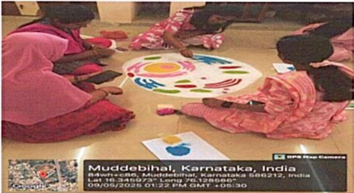
Students involved in Rangoli programme